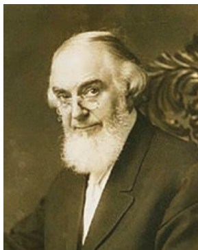
Charles Taze Russell

Jehovah’s Witnesses claim that Christianity fell into general apostasy (abandonment of the faith) under Emperor Constantine in the fourth century AD. God appointed Charles Taze Russell to restore pure worship in the last days and establish the Watchtower Society to provide spiritual truth through literature such as The Watchtower and Awake!