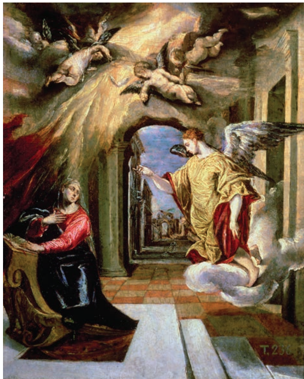
THE ANNUNCIATION—EL GRECO (GREECE/1541–1614)