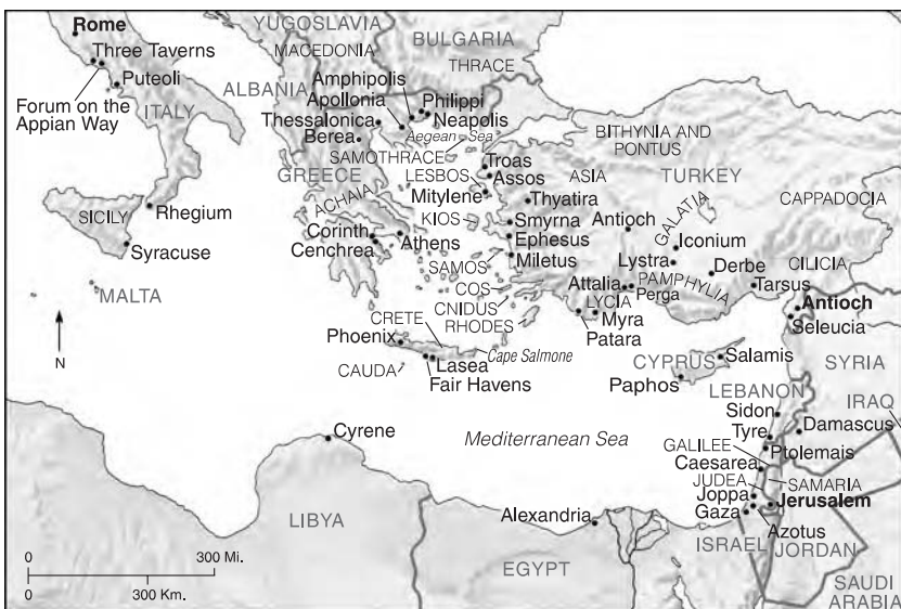
Modern names and boundaries are shown in gray.

Acts The apostle Paul, whose missionary journeys fill much of this book, traveled tremendous distances as he tirelessly spread the gospel across much of the Roman Empire. His combined trips, by land and ship, equal more than 13,000 miles (20,917 meters).