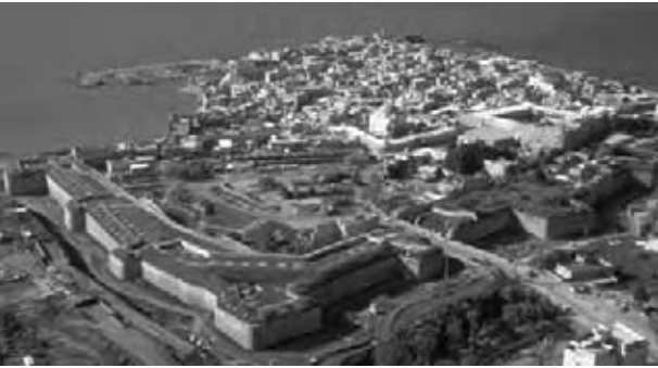
Aerial View of Acco

ACELDAMA* KJV form of Akeldama, meaning "Field of Blood," in Acts 1:19. See Blood, Field of.