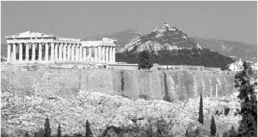
The Acropolis in Athens with the Parthenon

2 Macc 6:1-6). The next year Antiochus sent a garrison to build the Acra and maintain his religious reforms, primarily to see that no aspect of the Jewish religion was practiced in the city. The Acra also served as a storehouse for food and loot plundered from the city. The Jews considered it “an ambush against the sanctuary, an evil adversary of Israel continually” (1 Macc 1:36).