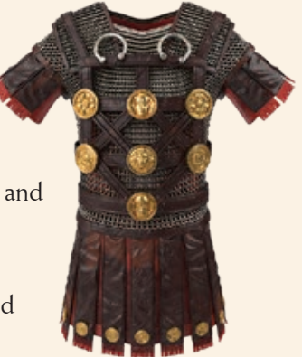
Chain Mail Breastplate

© 2024 Rose Publishing Permission granted to the original purchaser to print out. It is illegal to sell, email, replicate, duplicate, or post any part of this on the Internet. Download catalog and sign up for Rose Bible e-Charts at www.hendricksonrose.com Title: Armor of God Product Code: 575X ISBN: 9781596360297