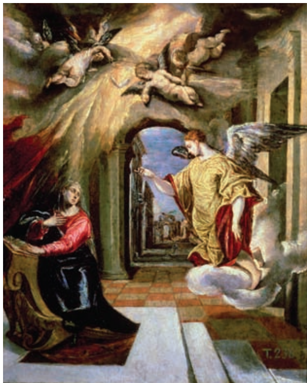
THE ANNUNCIATION—EL GRECO (GREECE/1541–1614)