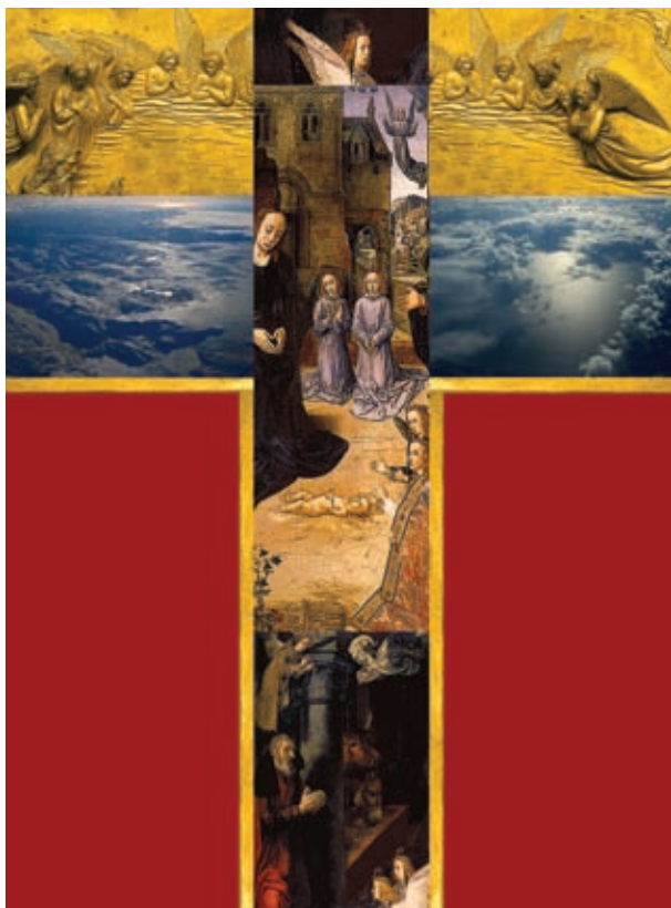
GENERATIONS WAITED FOR WHAT WE LOOK BACK AND CELEBRATE —E. JOHN WALFORD (ENGLAND/CONTEMPORARY)